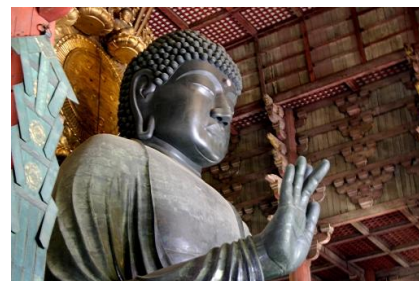
Todaiji Temple (Daibutsu)